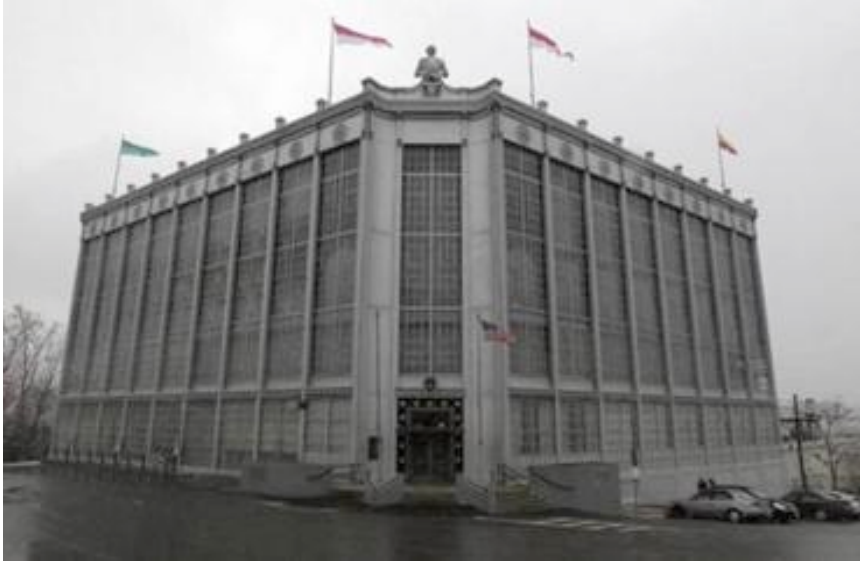
Figure 2.1: Leland’s steel and glass creation, looking much the same in 2013 as in it did when first built. 13

The new building was built directly in front of Worcester Pressed Steel, linked to its parent company by a passageway and catwalk that allowed visitors to tour the museum and then view the factory itself. The upper museum floors were “arched and plastered to form a two-winged hall” that Higgins and Leland designed to resemble the Great Hall of Prince Eugene’s castle in Hohenwerfen, Austria, a sight that had greatly impressed Higgins on his European travels. 14 The two wings of the museum’s Great Hall featured “ancient” and “modern” subject matter; the former showcasing chronologically exhibited suits of armor and ancient weaponry while the later displayed pieces of modern metalwork that included automobile parts and other “crowning examples of mass production,” such as airplane parts and utensils. 15