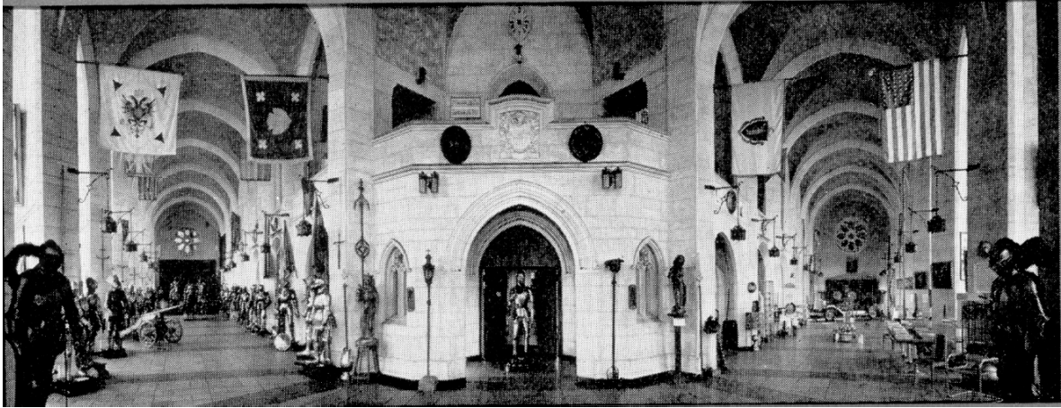
Figure 2.2: The Ancient and Modern Wings (left and right) of the Higgins Armory Museum. 16

Visitors could also follow a silver line that led through the exhibits to the gallery of the plant and observe PRESTEEL workers in action. Guides and labels within the gallery explained the machinations of steel working, including comparative strength, weight, and costs as well as the processes of rolling, drawing, stamping welding and tempering metals. 17 John Woodman Higgins hoped that by allowing visitors to experience steel workmanship firsthand, he could inspire them to see modern industry workers as creators of functional art, similar to armorers. He lamented, “Early Gothic armor was rightly classed with the fine arts, but modern supersonic aircraft, submarines, missiles and rockets are just machines.” 18 Higgins hoped that a visit to his museum would cause people to think differently.