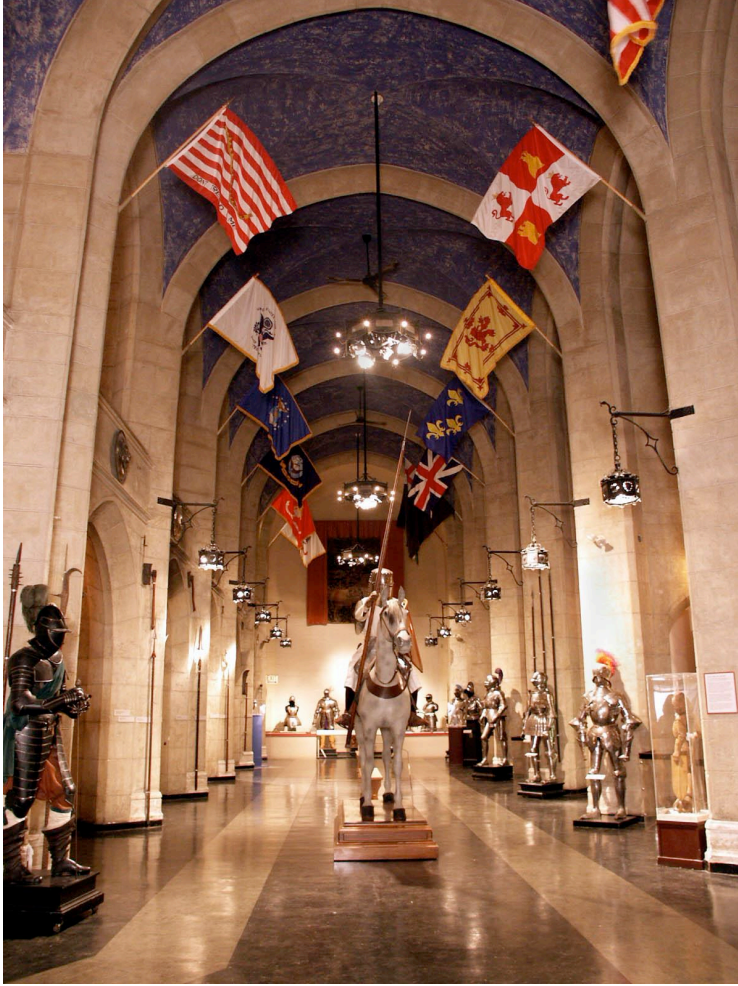
Figure 6.1: Since 1971 half of the Great Hall has been devoted to additional armor displays. 52