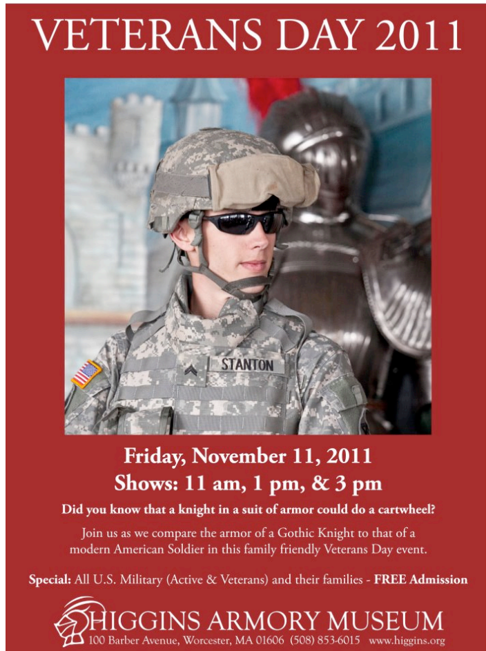
Figure 11.1: Creative programs attempt to make armor relevant to modern visitors. 77

great deal on low budgets. Higgins community programming brings in nearly as many visitors as the armor and events are often constructed with volunteer effort, handmade extras, and creativity. The museum's staff also draws heavily from modern museum theory and actively works towards increasing visitor engagement through contextualized, interactive exhibits.